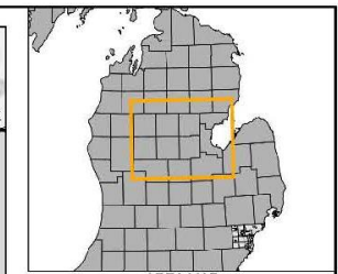
AREA MAP NOT TO SCALE