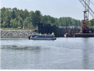
Gladwin County and representative from Sen Peters office joined us for the Secord Dam Tour event.

A huge shout out for our sponsors of the Secord Dam Pontoon Tour . Not only were people able to “get up and close to the dam from the water with a guided tour”, but it also turned into a neighborhood block party.