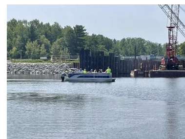
Gladwin County and representative from Sen Peters office joined us for the Secord Dam Tour event.

We recognize there are more questions than answers available now. Look for more informational updates from the FLTF and Secord Lake Association. Our last in-person meeting for the 2024 season is Saturday, October 19 th at 9 AM – Secord Township Hall. ((PLEASE NOTE THE 9 AM START TIME))