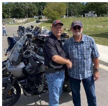
Chuck w/ US Senator Gary Peters